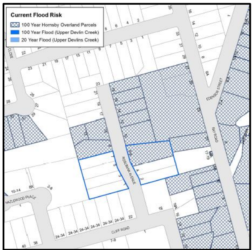
Figure 13: Flood mapping