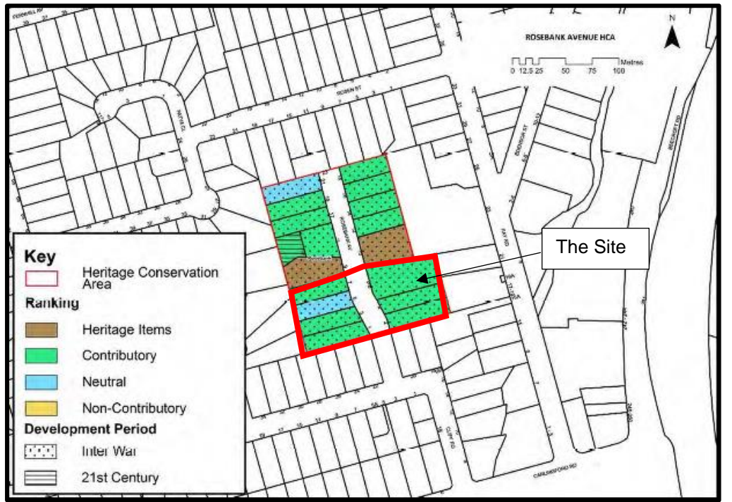
Figure 12: Ranking of Heritage Items (Epping Town Centre (East) Heritage Review)

While the Department supports the balanced approach proposed; to allow for development which will facilitate a more sympathetic transition, it is recommended a reduction in height for the northern properties be amended in the proposal. This will ensure that development achieves the intended outcome. It is also recommended that consultation with Heritage, Department of Premier and Cabinet be carried out to allow for consideration of the heritage impacts.