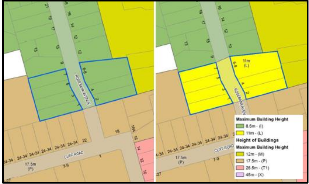
Figure 8: Existing maximum height of buildings (left) and proposed (right).