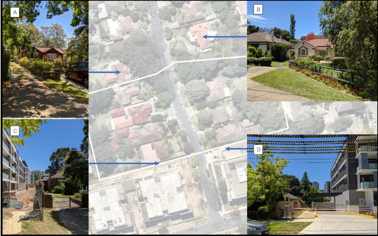
Figure 3: Photos taken 14 November 2019.

Figure 3 below depicts two items of local heritage significance: 9 Rosebank Avenue (A) and 10 Rosebank Avenue (B) which adjoin the subject site. Figure 3 also depicts two interface examples: the boundary between 1 Rosebank Avenue and apartments along Cliff Road (C) and the boundary between 2 Rosebank Avenue and the apartments along Cliff Road (D).