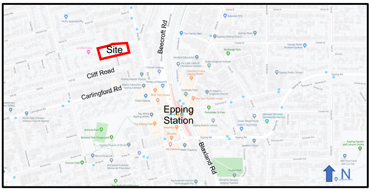
Figure 5: Site and surrounding area map

Epping Station is at the juncture of two lines. The Northern Line has regular services to Hornsby to the north and Strathfield and Sydney City to the south and south-east. Sydney Metro North-west has regular services to the Hills in the west and Chatswood to the east. Macquarie Park, a key employment and education area, is 6 minutes from Epping by Metro.