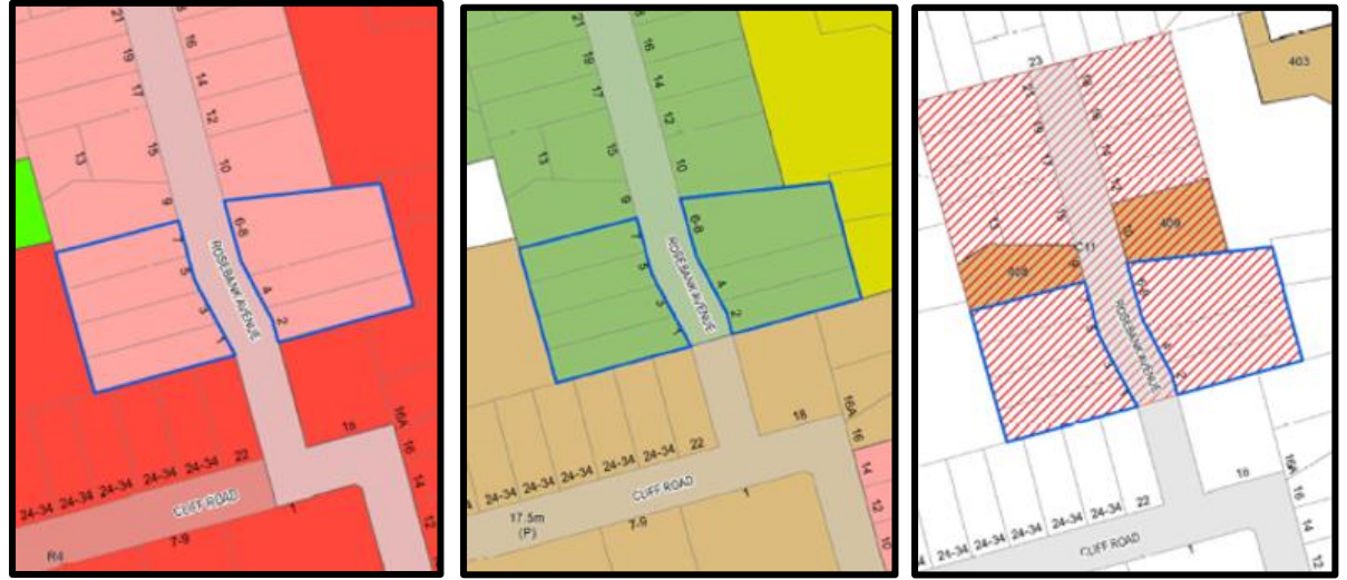
Figure 4: Existing planning controls with site bound in blue (zoning left, height of building centre, heritage right).