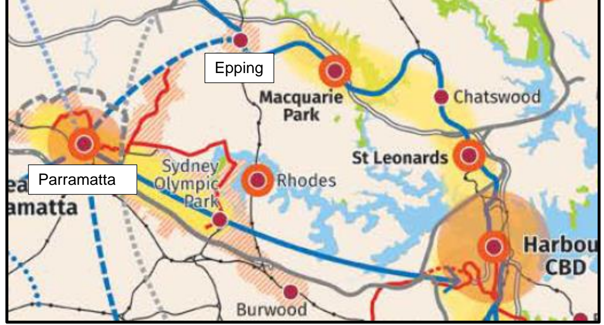
Figure 6: Location of Epping