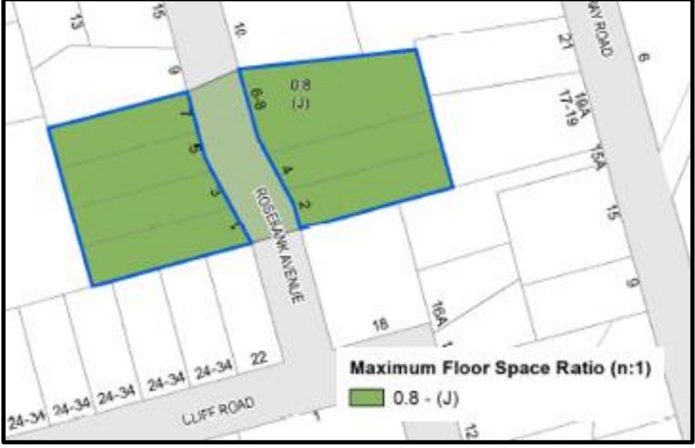
Figure 10: Proposed maximum floor space ratio.