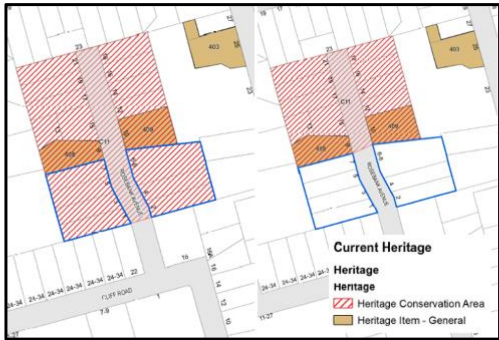
Figure 9: Existing heritage (left) and proposed heritage (right).