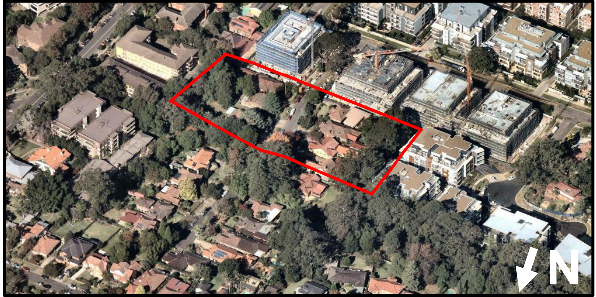
Figure 2: Site shown by red boundary - oblique view.